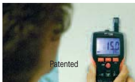
Patented Measure moisture of wall material with non-invasive Pinless technology