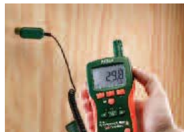
Pin Moisture Probe included for making contact moisture measurements